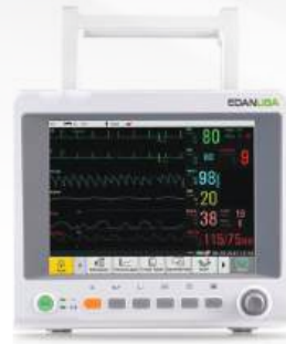
iM60 Patient Monitor